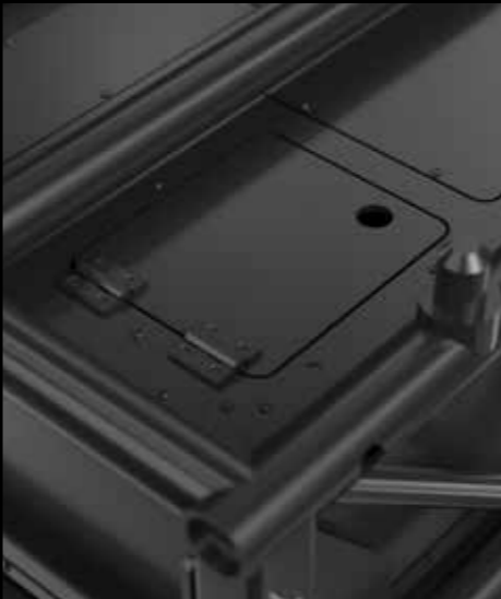
5L fluid storage

Integrated with a 5L fluid container and optimally designed mixing chamber, the unit provides consistent performance for heavy-duty applications.