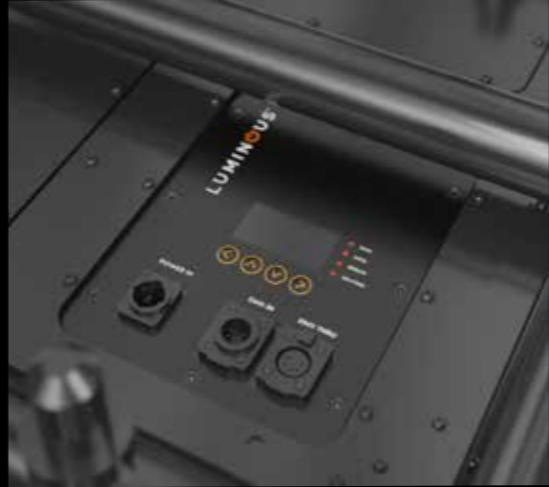
Integrated DMX control

The system is modular, enabling easy integration of multiple units for variable lengths. Rigging is simplified with truss-mounted design, and control is streamlined via built-in DMX functionality.