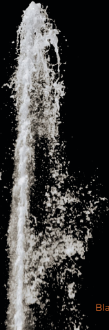
Blasts up to 30m