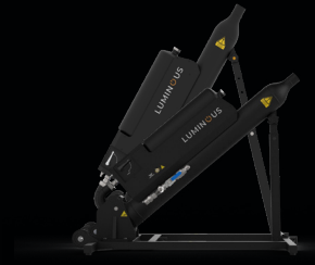
Adjustable Firing Angle

Portable and versatile, the SHOCK-WAVE is engineered to energise crowds with its dynamic water display. The water cannon offers an eco-friendly alternative to traditional confetti or CO 2 burst effects, requiring only water. Its sleek, modern design integrates seamlessly with any stage setup, ideal for showcasing the sudden impact of SHOCK-WAVE.